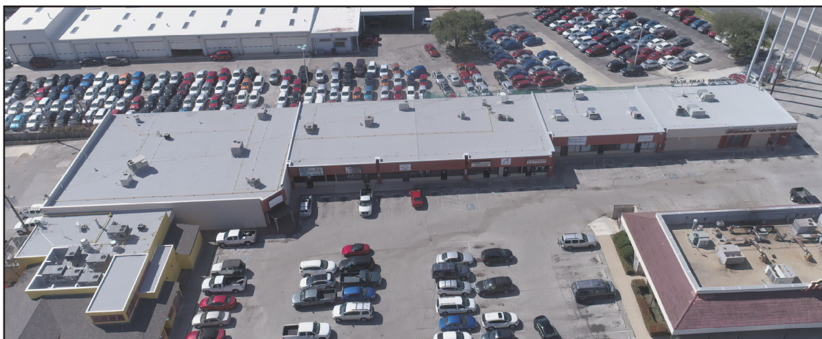
THE NEW ROOF ON THE SAN PEDRO SQUARE SHOPPING CENTER, IN SAN ANTONIO, TEXAS.